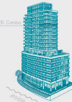
16 A/B Combo

The purchase price of #16A/B has been calculated by combining the individual prices of Units 16A and 16B as filed in the Offering Plan. Purchasers desiring to have the Units combined into a single Unit will also pay Sponsor an additional fee to cover the architectural, construction and legal expenses associated with the combination, subject, however, to an amendment to the offering plan to be filed by Sponsor with the NYS Attorney General's Department of Law disclosing the amount of such fee.