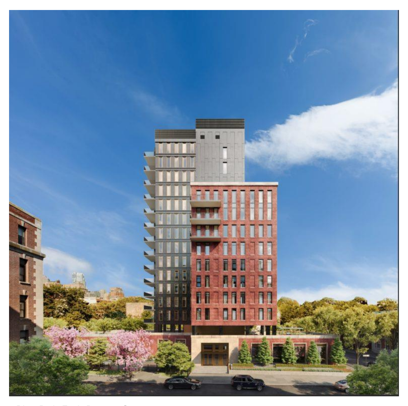
5 River Park, Fortis Property Group